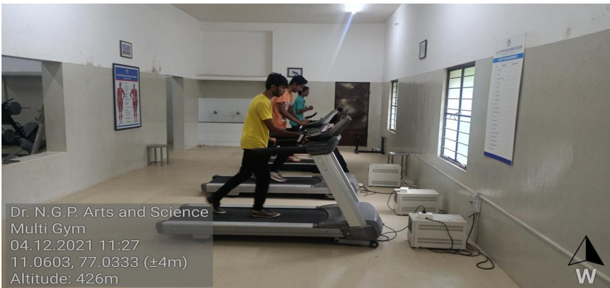
Fitness Centre in G Block for all students and staffs