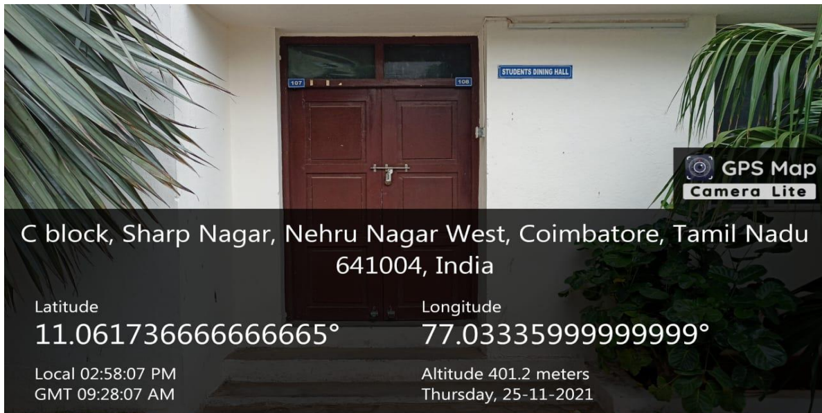
Student Dining Hall near NGP Conference Center