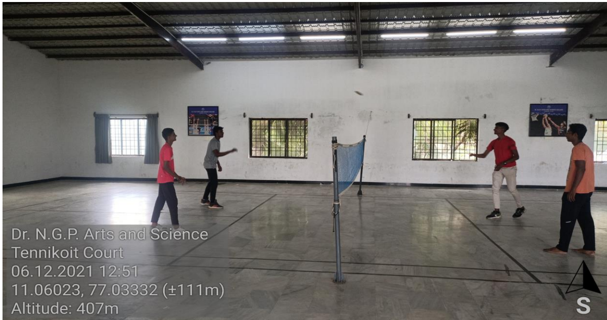
Indoor Facility: Staff Relaxing Amenities