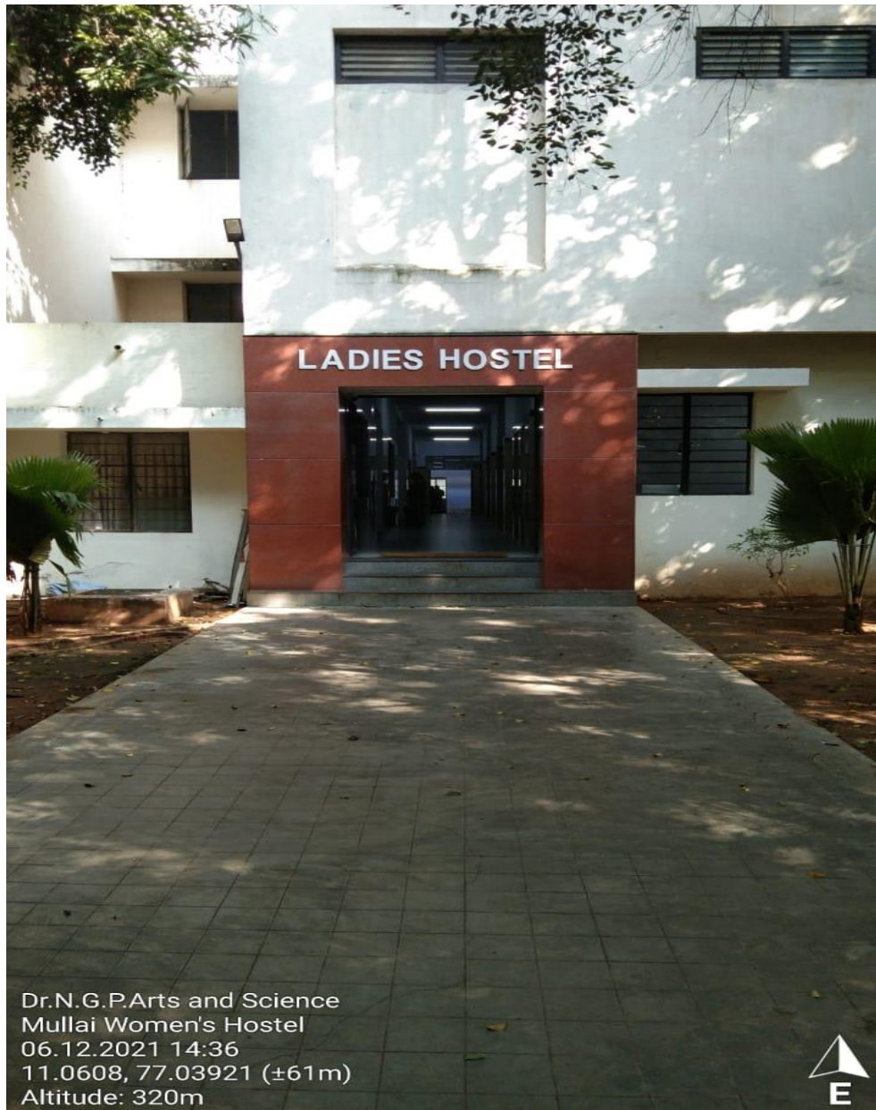
Mullai Hostel for Women Staff members and Girl students in well-protected environment