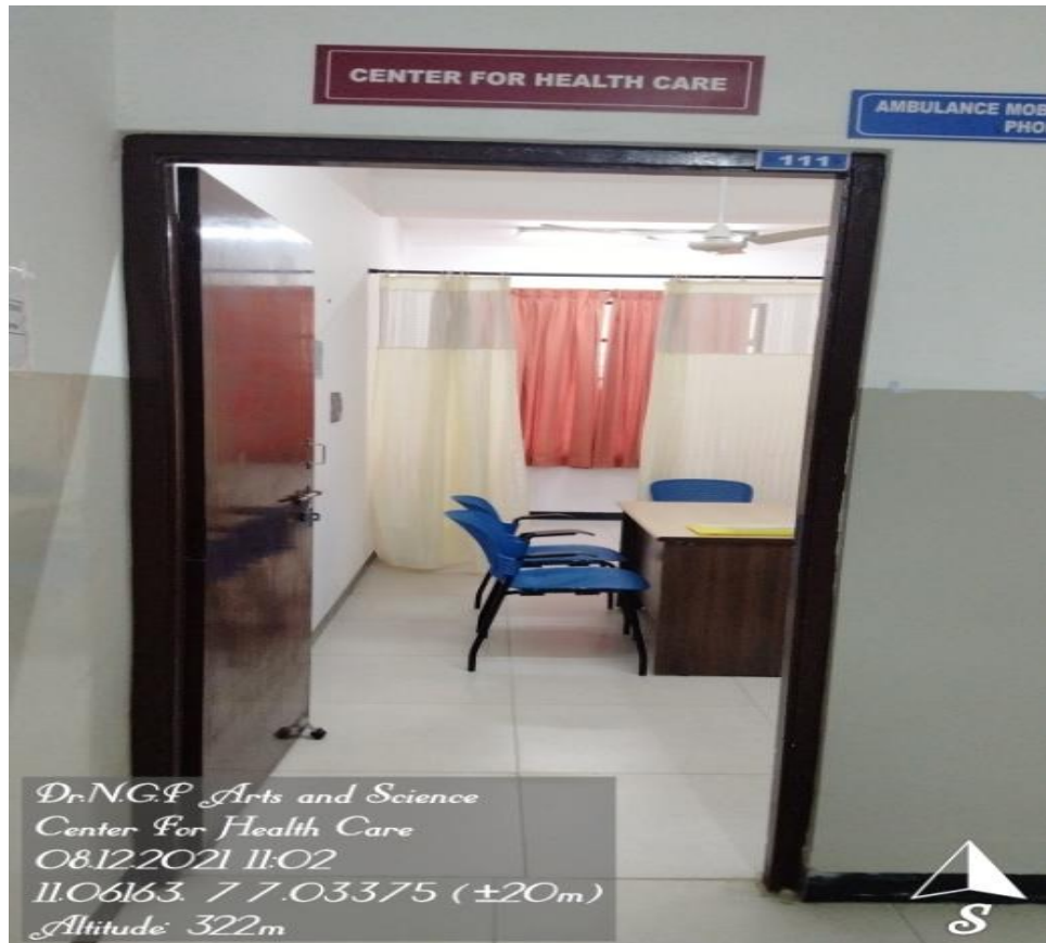
Center for Healthcare in the C1 Block