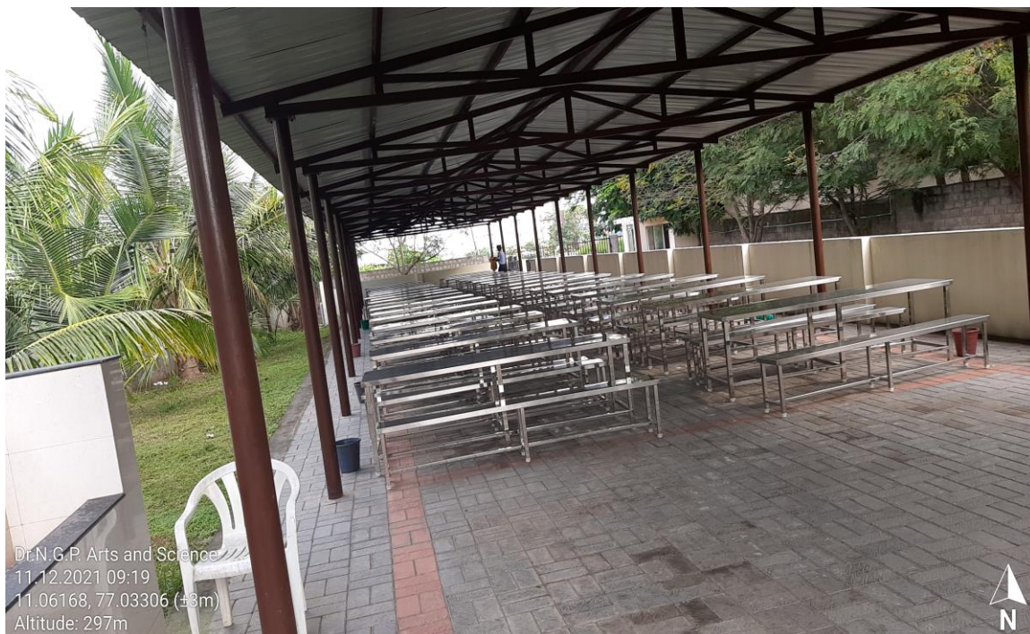
Common Dining Hall for Students within the campus