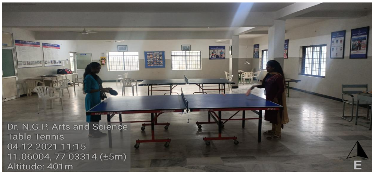
Indoor Facility: Relaxing Amenities within college premises