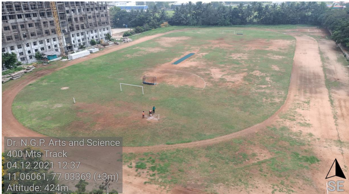
Playground for sports activities in the campus