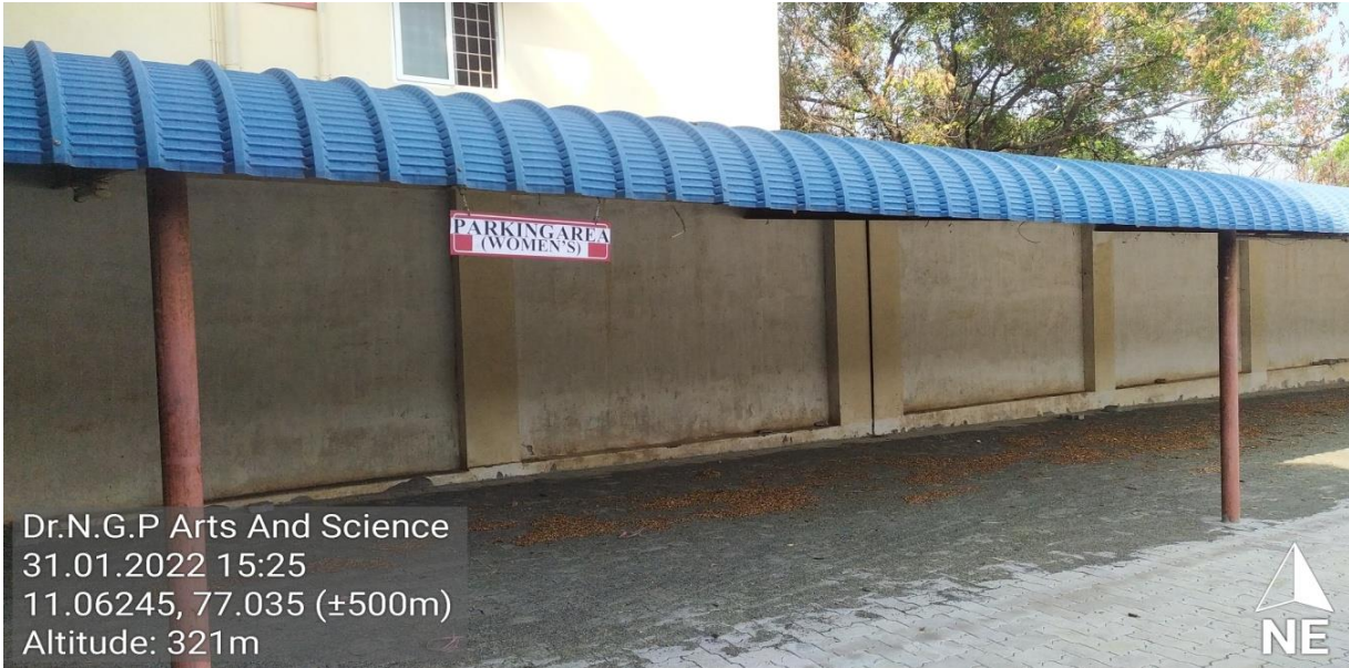
Exclusive parking area for women