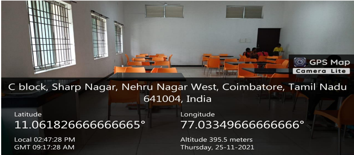
Common Dining Hall for Staff Members in the Canteen