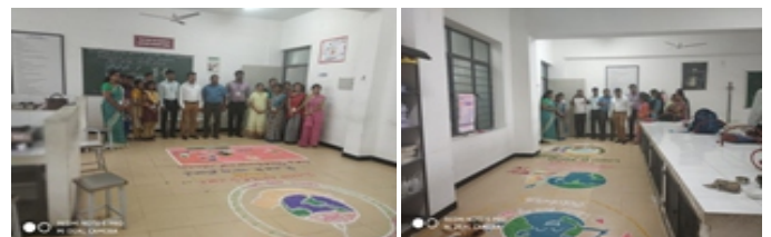
RANGOLI DRAWN BY OUR STUDENTS

Department of Food Science & Nutrition students were participated in rangoli competition based on the theme "Our Actions are our Future" organized by the Department of Food Science and Nutrition. The best rangoli was appreciated and given prizes.