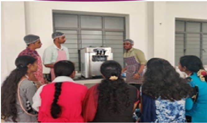
STUDENTS DEMONSTRATING THE ICE CREAM AND PASTA MAKING INDUSTRIAL VISITS

Department of Food Science & Nutrition students along with faculties have visited various industries and institutions during their academic year.