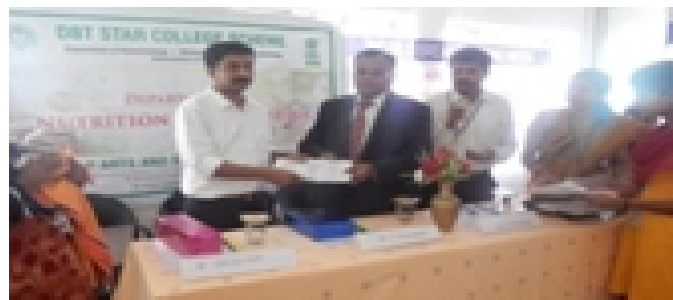
GOVERNMENT HOSPITAL, COIMBATORE

The Department organized an "Awareness Program on Significance of Breast Feeding", at Government Hospital on 5 th August 2019. The pamphlet and booklet (Galactagogue foods) was released on this special occasion.