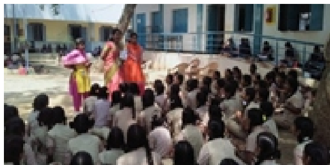
Conducting Quiz competition to Government school students

On 27 th February 2020, Department of Food Science & Nutrition conducted quiz competition for Government school students, Tirupur.