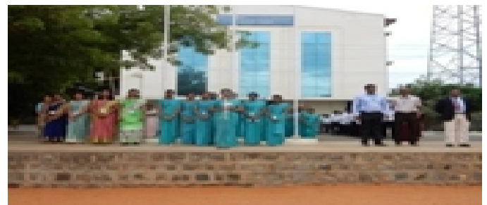
Oath taking at Dr.N.G.P Arts and Science College

The breast feeding week celebration was started in advance on 26 th of July by taking an oath (Empower parents- Enable breast feeding now and for the future).