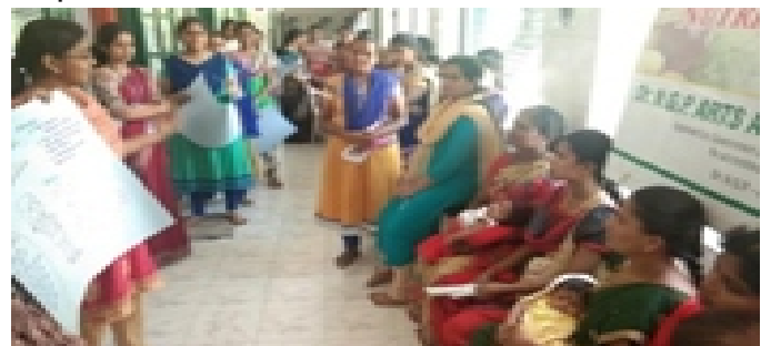
Primary Health care center, Peelamedu

Education was given to the lactating mothers at Primary Health Center Peelamedu. The beneficiaries were about 50 prenatal and postnatal mothers.