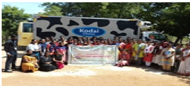
Kodai Cheese, Kodaikanal 06.09.2019