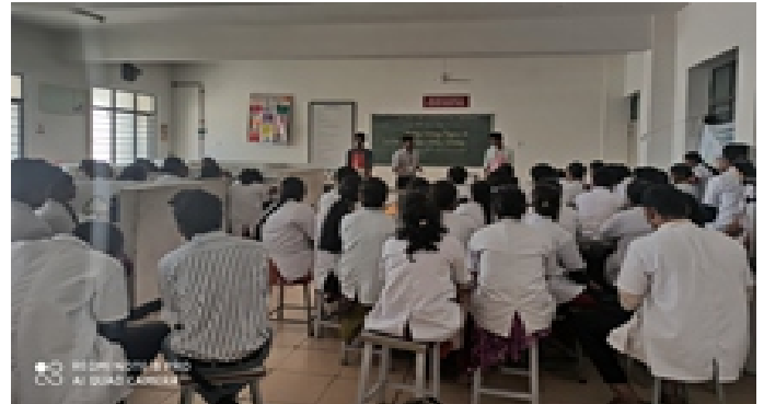
KNOWLEDGE EXCHANGE PROGRAMME ON MILLET PASTA AND ICE CREAM DODDABETTA TEA FACTORY, OOTY- 15.02.2020

On 18 th & 19 th February 2020, Department of Food Science & Nutrition students participated in enumeration of bacteria, yeast and mold in the Department of Microbiology in exchange of that our department students have demonstrated the incorporation of millets in pasta and preparation of ice cream to microbiology students.