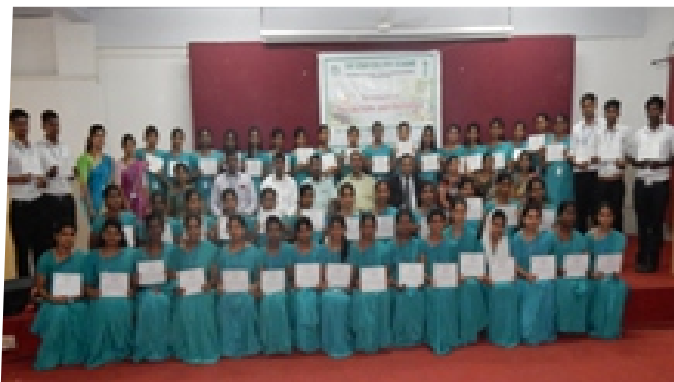
STUDENTS RECEIVED CERTIFICATES