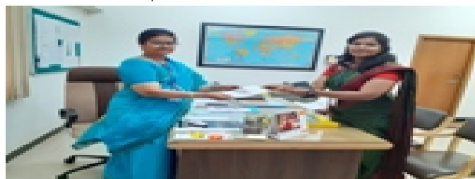
N.G.P School, Coimbatore

Department of Food Science and Nutrition organized Awareness Program on 12 th February 2020. Education was given to the N.G.P School students, Coimbatore