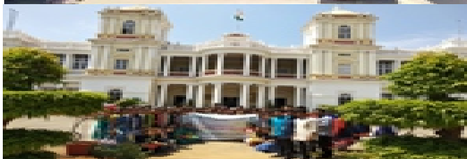
CFTR, Mysore 18.02.2019