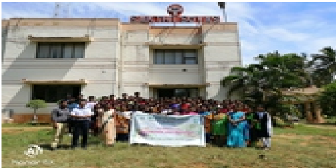
SAKTI SUGARS, POLLACHI-18.07.2019

Department of Food Science & Nutrition students along with faculties have visited various industries and institutions during their academic year.