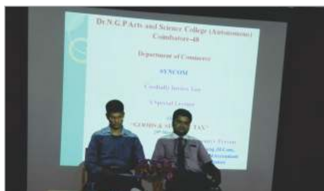
A Special Lecture on “Goods and Service tax”