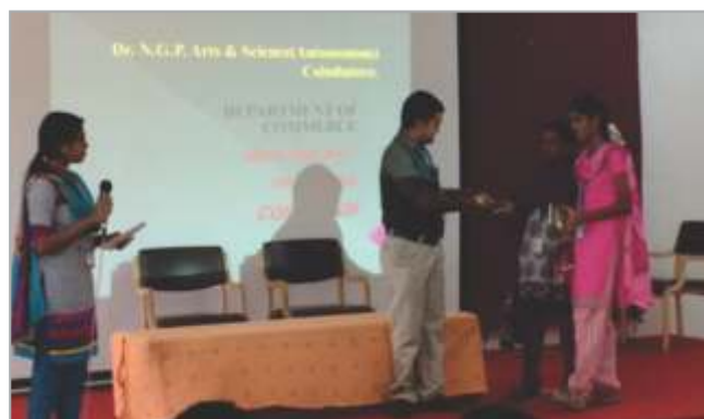
“Com Quiz 2017”