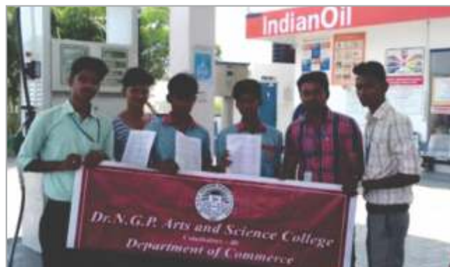
“Prevention of Child Labour” Veeriyampalayam Village on 23.02.2017