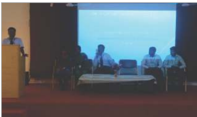
“Placement Readiness Program”