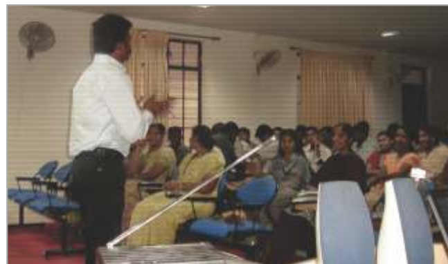
A Guest Lecture on “ Capital Market and Equity Investment ”