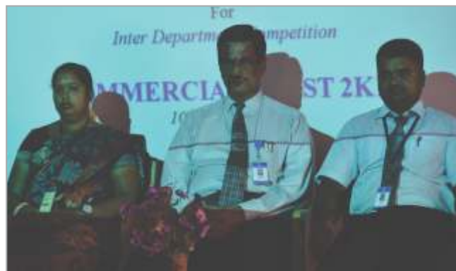
Inter-Department Competition “Commercial Blast 2K16”

“Commercial Blast 2K16” an Inter–Departmental Competition was conducted the by final year UG Students on 10.08.2016. The competitions like Paper Presentation, paper Collage, Graphical Sketching, Photography and Ad-Zap were conducted for the students.