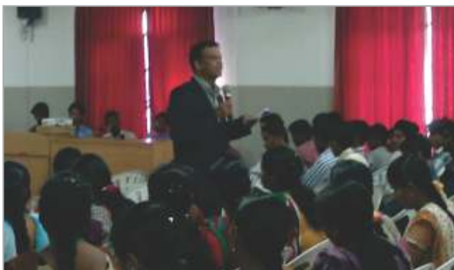
A Guest Lecture on “ GST & VAT ”

A Paper presentation event was organized by the I PG Students on “Union Budget” on 22.02.2017