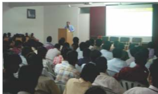
A Significant Lecture on “ Key Changes in Income tax Act ”