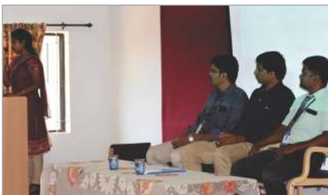
A Special Lecture on “Future-Opportunities & Challenges ”