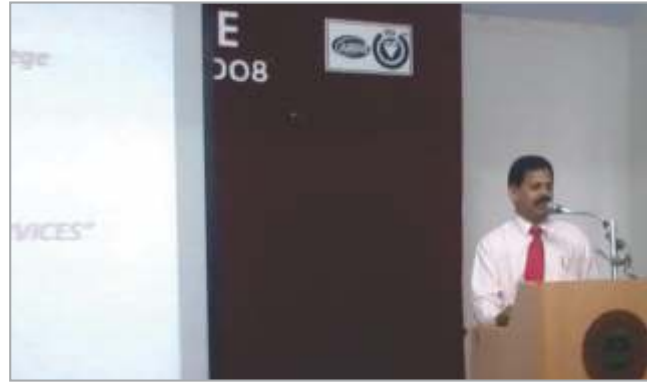
A Guest Lecture on “ ACCA in India ”