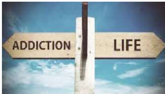
International Day against Drug Abuse Rally on 27-06-2016.