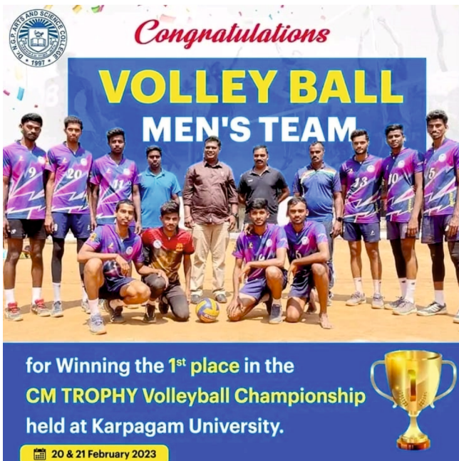
Our volley ball team won 1st place in the CM Trophy Volleyball Championship at Karpagam University from 20.02.2023 to 21.02.2023