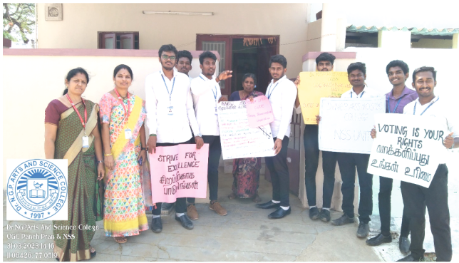
UGC Panch Pranand Nss Unit I Jointly Organized “Outbound Training On Duties Of Citizens Towards The Nation” at Veeriyampalayam Village on 31.03.2023