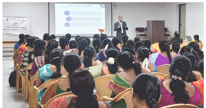
Center for Faculty Development and Sraddha Academy for Financial Education jointly organized a Faculty development programme on the topic "Investor Awareness Programme" on 21.07.2022