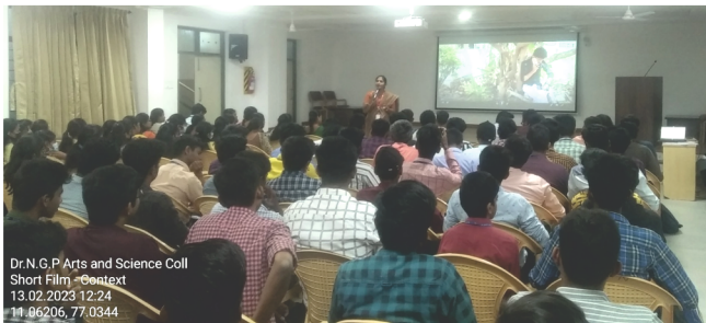
Department of Commerce with Corporate Secretary ship CA celebrated National Productivity Day and conducted Self-Reliance through Productivity-Short film contest on 13.02.2023