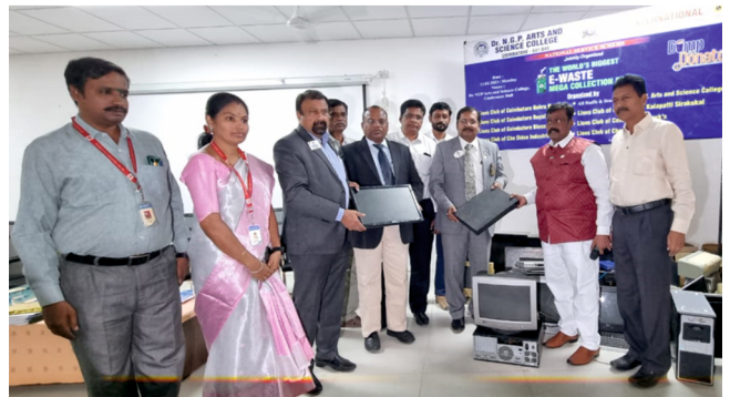
National Service Scheme And waste Management Committeein Association With Lions Club International, organized a E-Waste Awareness and Donation Programme in Coimbatore on 13.02.2023