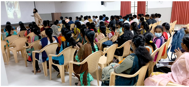
Department of Commerce Accounting and Taxation conducted Quiz competition on International Customs Day in KambarArangam on 25.01.2023