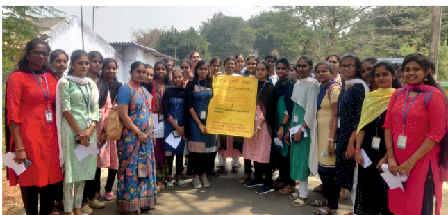
Extension Activity – "Awareness Programme on Pradhan Mantri Jeevan Jyoti" at Nellithurai on 11.03.2023