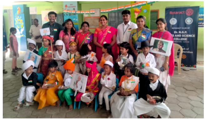
Rotaract Club of Dr.N.G.P. Arts and Science College in association with Rotary Club of Coimbatore Meridian Celebrated 77th Independence Day in Government Primary School, Saravanampatti, Coimbatore on 26.01.2023