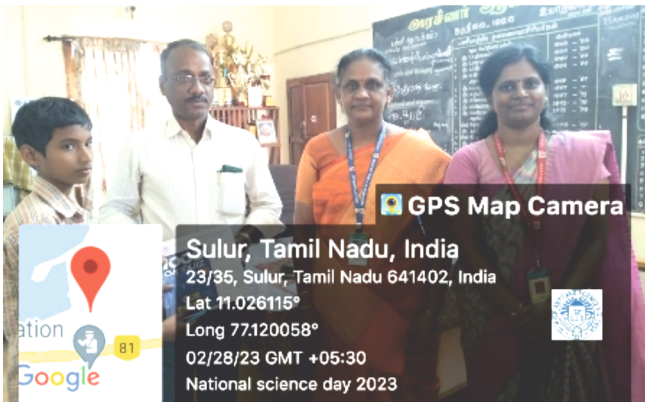
Department of Costume Design and Fashion celebrated National Science Day 2023 at Government Boys High School, Suluron 28.02.2023