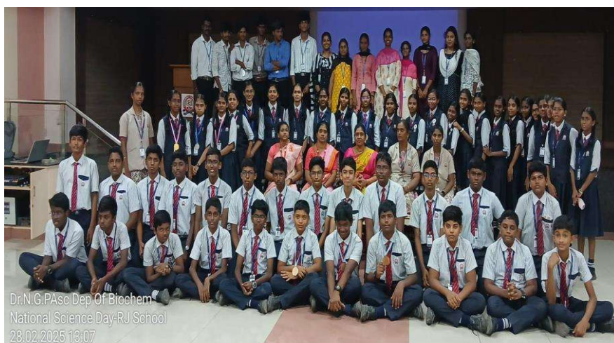
Group photo after the valedictory session of the science day held on 28 th February 2025 at St. Joseph Matriculation School, Coimbatore