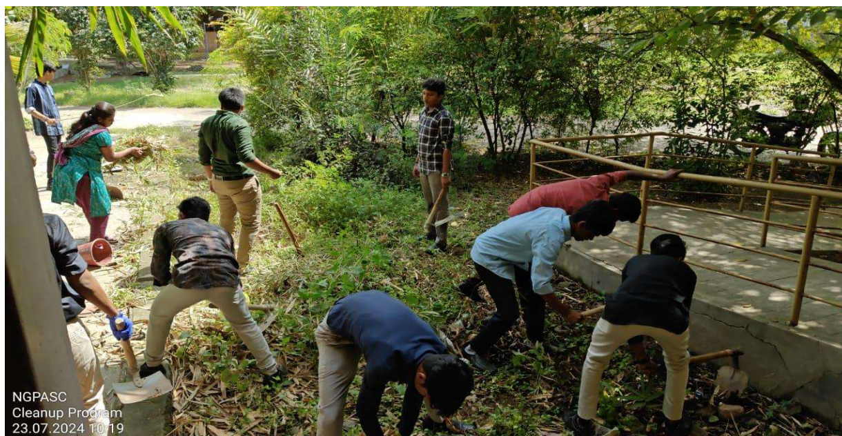
Dr.N.G.P. Arts and Science College Biochemistry and Eco Club Students cleaning the garden to establish the herbal garden