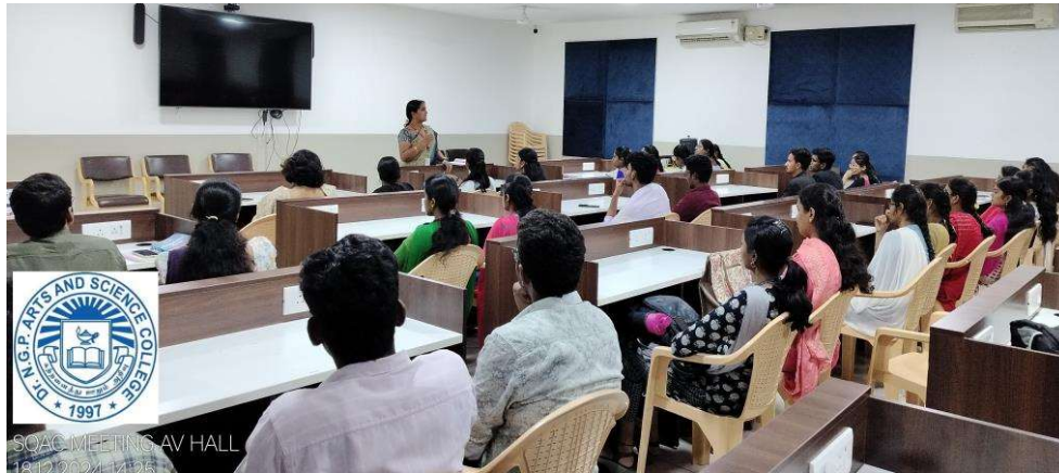
SQAC Meeting organized for the members and being addressed by the SQAC Staff Representatives

To discuss on free upskilling online courses facultywise. Orientation to SQAC student volunteers to motivate all II UG and I PG students to enrol themselves in the free online certificate courses that fosters students' potential in skilling. More than 800 students enrolled out of which close to 500 students have completed the course and received certificates across all discipline. A total of 176 different courses were opted by the students.