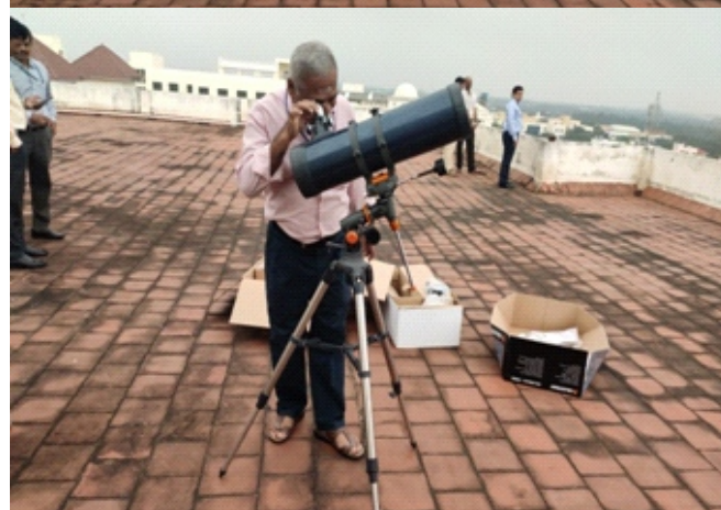
Enjoy watching the eclipse with solar glasses, telescope during the solar eclipse on 26.12.2019.