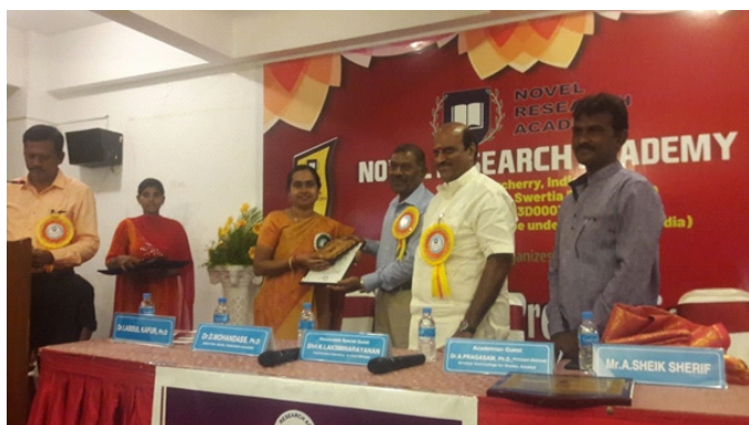
Novel Research Academy - Best Women faculty Award