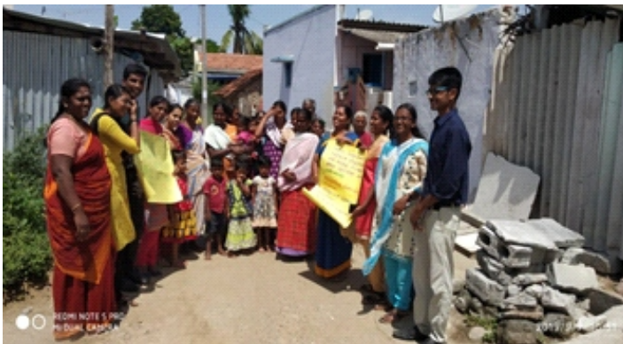
Extension Activity – Awareness on conservation of water, cleanliness, hygiene and sanitation for Public at Chinna Thadagam, Coimbatore.