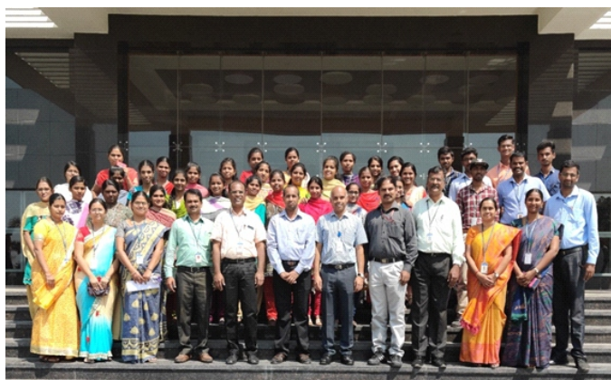
Workshop Participants with Speakers