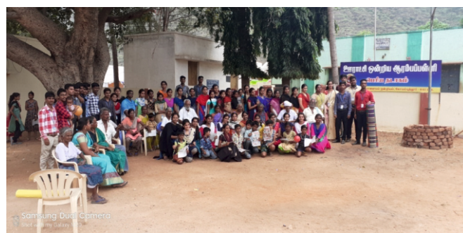
Extension Activity on Environment Enrichment through Conservation of Resources on 27.01.2019