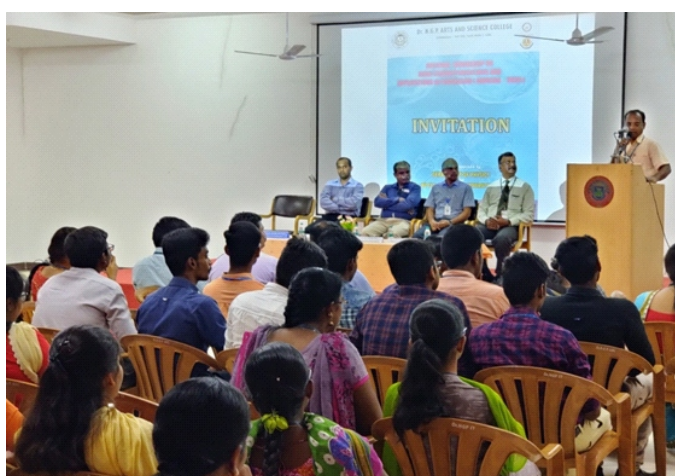
Chief Guest, Speakers on the dais along with participants

A two day National workshop was conducted by Department of Physics in association with DRDO-BU CLS on February 20-21, 2020.