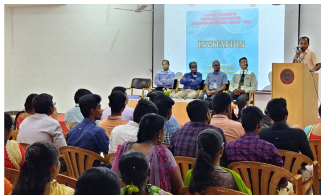
Chief Guest, Speakers on the dais along with participants