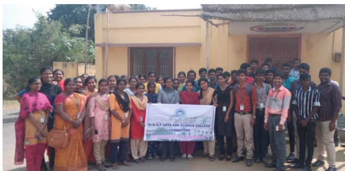
Extension Activity on Preparation of household chemicals and awareness programme on Importance of medicinal plants to village people at Veeriyampalyam village on 08.02.2020