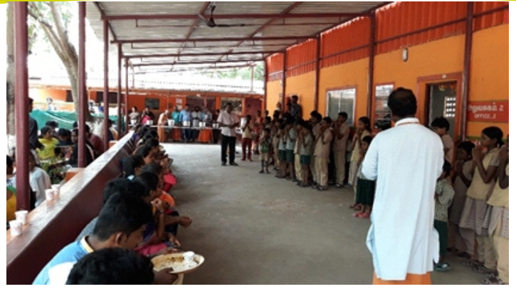
Extension activity – Awareness on plastic bag usage, save girl child & educate for School Students at Panchayat Union Elementary School, Chinna Thadagam, Coimbatore.