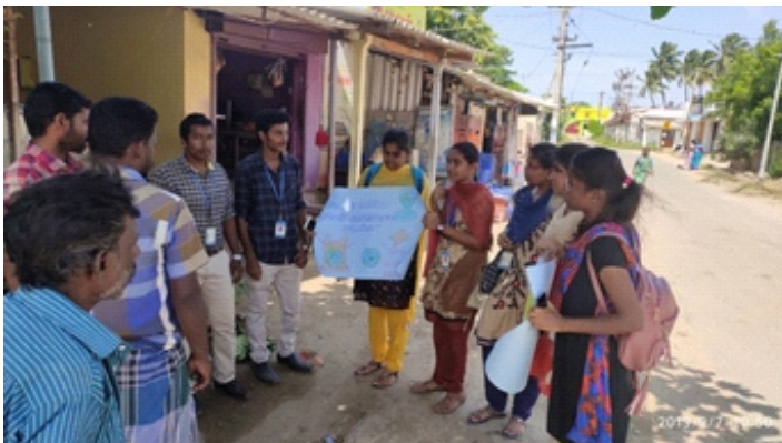
Extension activity – Social Issues for Public at Chinna Thadagam, Coimbatore.