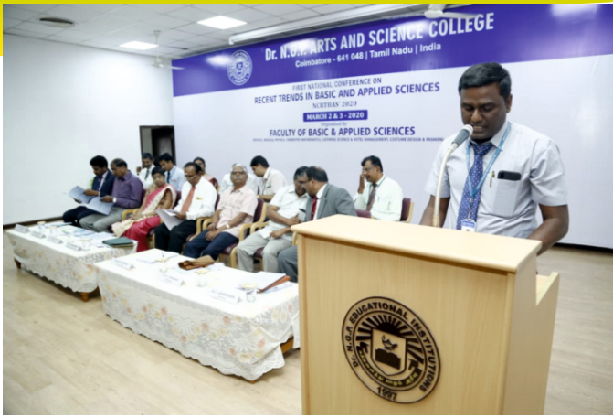
National Conference on “Recent Trends in Basic and Applied sciences” Organized by Dr. N.G.P. Arts and Science College (Autonomous) , Coimbatore on 02-03, March 2020.