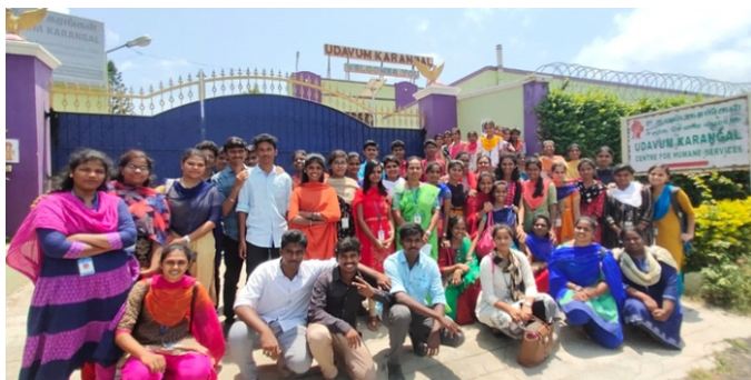
Workshop on Clear Face Confidence

“God has given us two hands; one to receive with and the other to give with” taking this into account the final year students from the department of costume design and fashion spot out an helping hand to the orphans of Udhavum Karangal, Othakkal mandapam. It was conducted on 14-09-2019. It was an fantastic day that the students were able to spent time with them. As the students are from the costume design and fashion field garments created by past year students were collected, which also by got the part of seniors and was given to the orphans as a giving hand. They were really excited to spent time with us. Few cultural was giving by the students later an enjoyable dancing was done altogether with them. We are glad that they were really happy to have the students there and to spent time with them. That was another best day happened in each one's life.