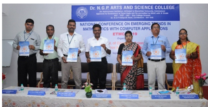
National Conference on Emerging Trends in Mathematics with Computer Applications on 12.09.2019