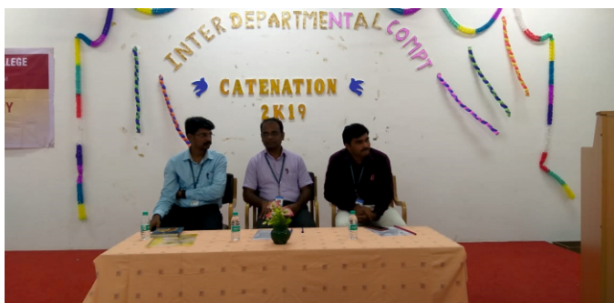
Organized interdepartmental competition as “ Catenation ” 2K19 on 04.09.2019