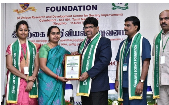
Nature Science Foundation – Best Women Faculty Award