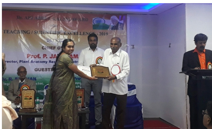
Marina Labs – Dr. A.P.J Abdul Kalam Award for Scientific Excellence Award