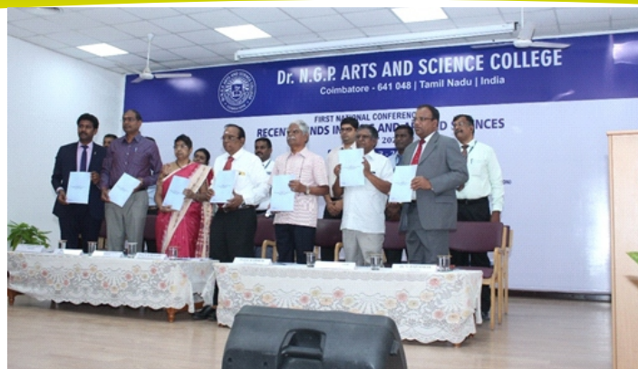
National Conference on Recent Trends in Basic and Applied Sciences on 2.3.2020 and 3.3.2020