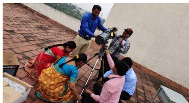
Setting up the telescope to observe the eclipse to observe the Annular Solar Eclipse on 26.12.2019

Report from Astronomy club for the activity done on the day of Solar Eclipse (26.12.2019)